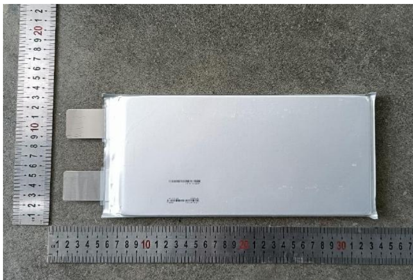
图 4 电芯正面 Picture 4 Front view of cell