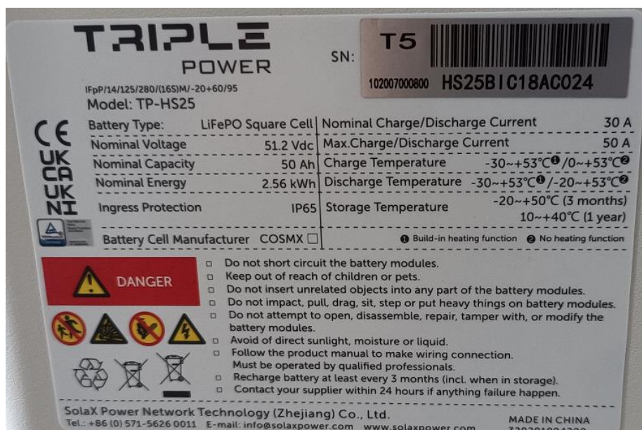
图 5 电池标签 Picture 5 Label of Battery