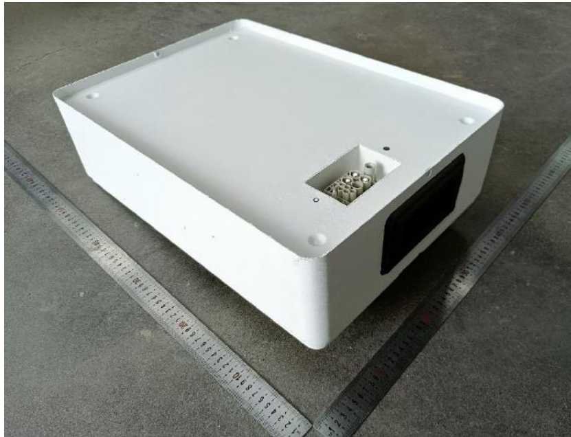
图 2 电池背面 Picture 2 Back view of Battery