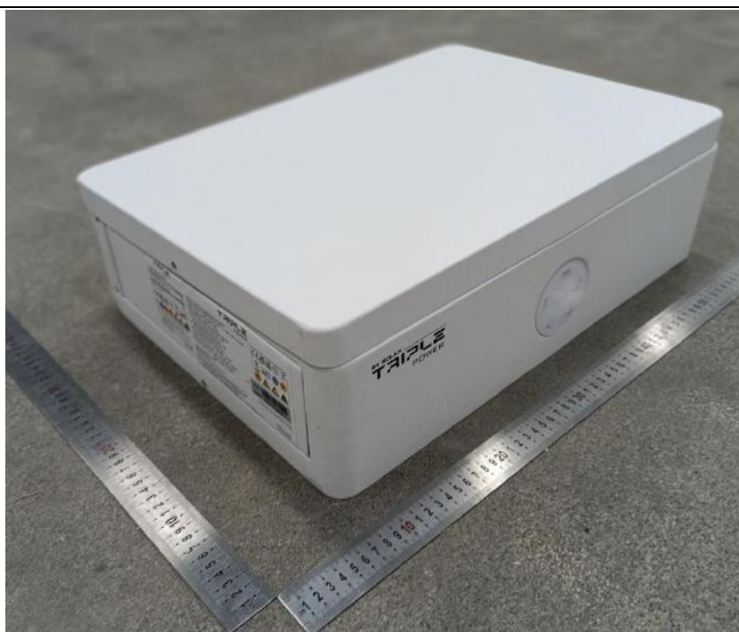
Picture 3 Control box