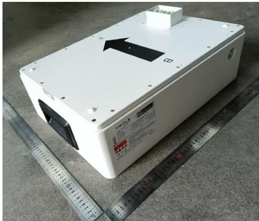
Picture 1 Side view of Battery