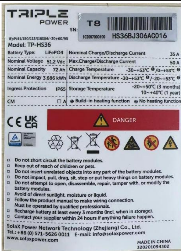
Picture 5 Label of Battery