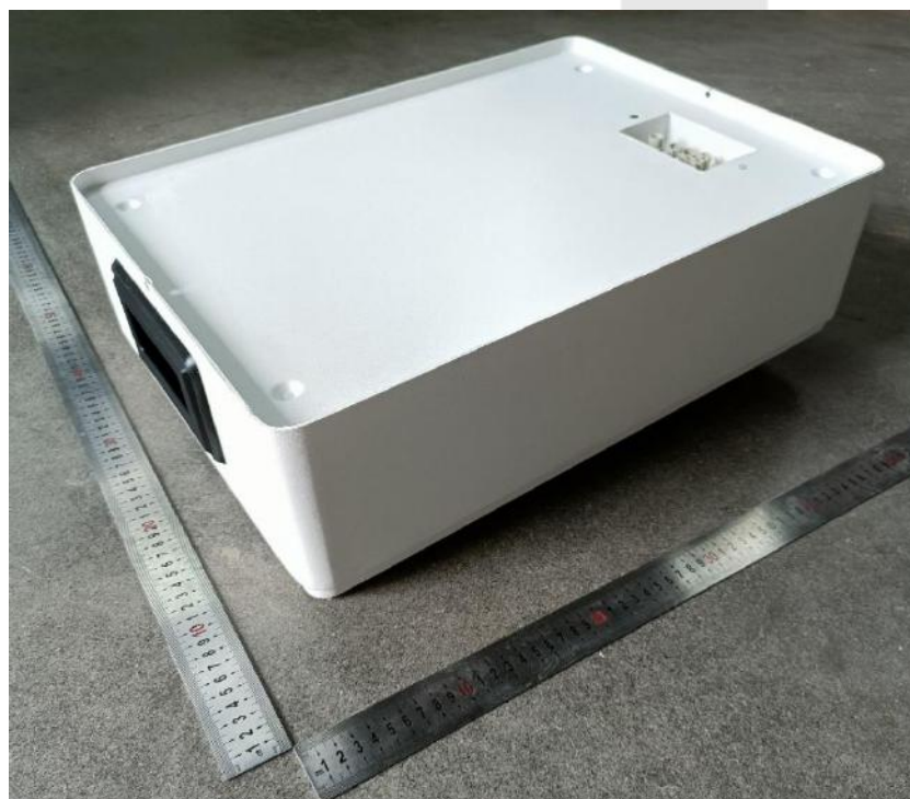
Picture 2 Back view of Battery